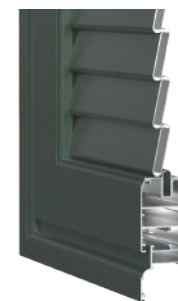
FIXED OVALINA CLOSED