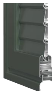
FIXED PLATE CLOSED