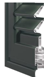
FIXED PLATE OPEN