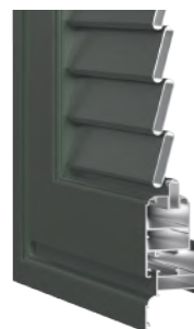
FIXED OVALINA OPEN